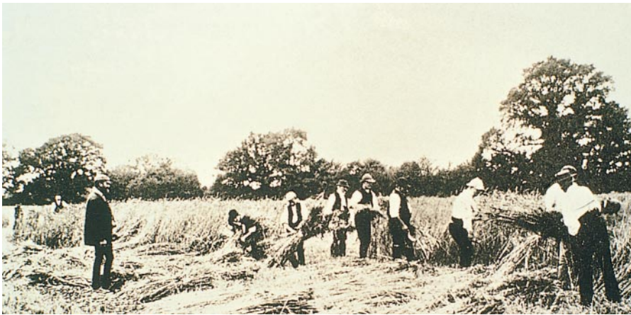
Figure 2 Field work: experiments on fertilizer regimes have run at Rothamsted since 1843.

niscient of the early stages of the industrial revolution, when inefficient factories polluted without restriction. The US Environmental Protection Agency estimates that, in the United States alone, livestock operations generate about 10^9 tonnes of manure per year, much of it in large-scale operations in which up to a million or more animals are housed in close quarters. These concentrated sources of manure are often too far from farms to be economically transported to them, or are applied at inappropriately high rates or at incorrect times, or are released into waterways without removing nitrogen and phosphorus. This has created an open nitrogen cycle that is rapidly degrading many other ecosystems 2 . Sustainable and productive ecosystems have tight internal cycling of nutrients, a lesson that agriculture must relearn.